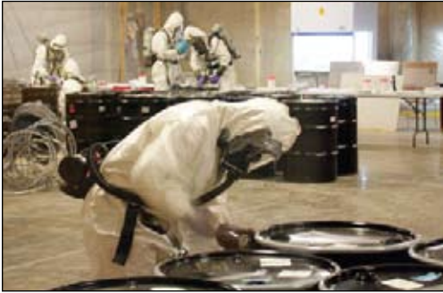
▲ Anthrax investigators in 2001